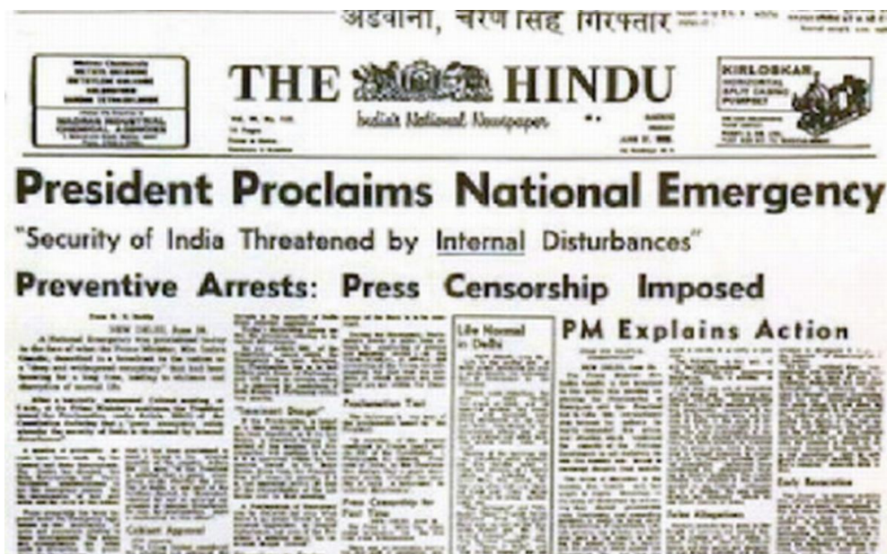
June 25, 1975