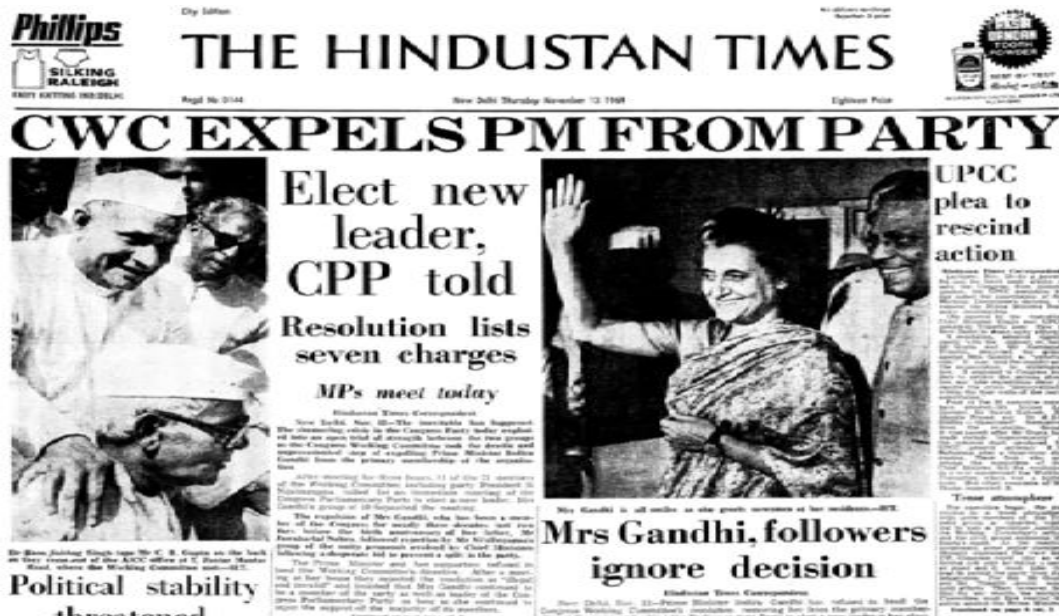
Source Hindustan Times on November 13, 1969

(i) The news article regarding the Prime Minister's expulsion from the party by the Congress Working Committee is provided below. What events resulted in the removal of the Prime Minister?